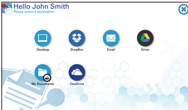
Easy access to PinPoint Scan 3 destinations from the MFP control panel